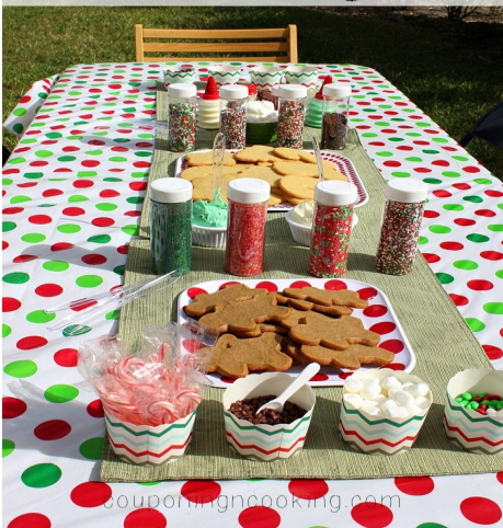
Cookie Decorating Party

We will be decorating cut out Christmas cookies during coffee hour on December 3.